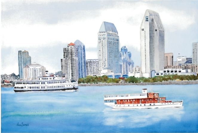
"Yachting San Diego" by Roni Sumer 15x22 Watercolor on Arches

Contemporary Impressionist captures movement, textures, rhythms and emotions in her Watercolor and Acrylic Originals and Giclée Prints.