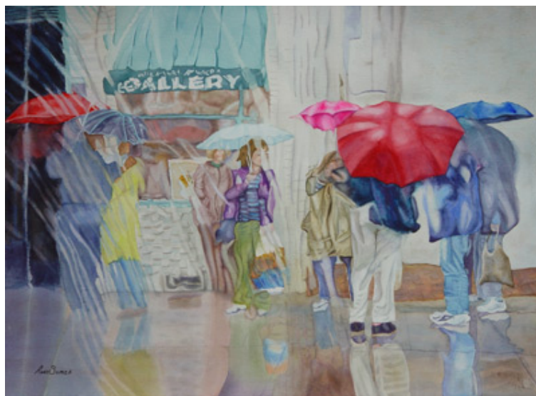
"Rainy Window View" by Roni Sumer 30x22 Watercolor on Arches

Roni Sumer Watercolors Fine Art Gallery - La Jolla, CA Eagle Fine Arts - La Jolla, CA Limner Gallery - Manhattan, NY Museum of the Living Artist - San Diego, CA Period Gallery - Omaha, NE Artisan's Gallery - Escondido, CA BAE Systems - Rancho Bernardo, CA Escondido Municipal Gallery - Escondido, CA SDWS Gallery - San Diego, CA La Jolla Artist Association Gallery - La Jolla, CA Southwestern Artists Gallery (Spanish Village)-San Diego, CA San Diego Hospice - San Diego, CA