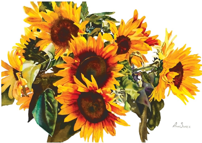
"Sunburst" by Roni Sumer 15x22 Watercolor on Arches